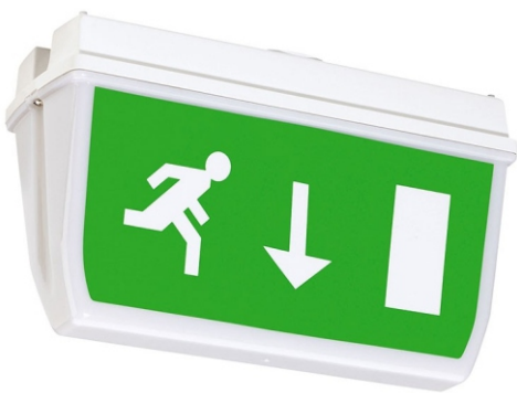
Optional: trapezium shape diffuser

- Optional: DALI digital self test in accordance with BSEN62034.